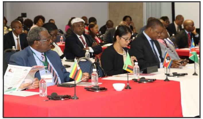
An array of delegates at the Assembly.