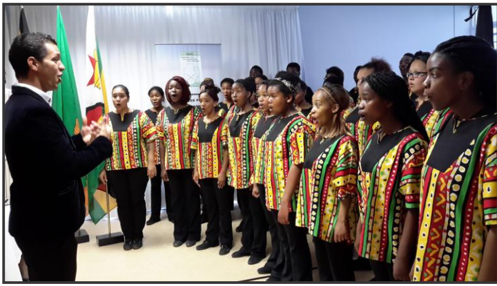
The Choir, entertaining delegates.