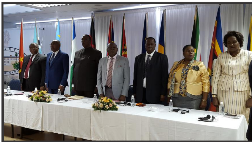
Delegates partake in the National and AU Anthems

among others. At the end of symposium, some Members raised concerns over several issues including youth empowerment, some National Parliaments that were still dominated by the Executive, climate change and the issue of Africa not represented on the United Nations' Security Council that has been in existence for the past 70 years.