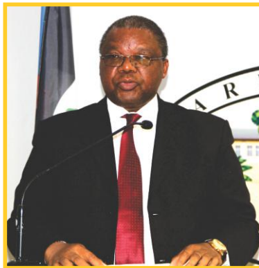
Hon. Themba Msibi, Speaker of the National Assembly of the Kingdom of Swaziland.

T he Speaker of the National Assembly of the Kingdom of Swaziland, Hon. Themba Msibi on behalf of SADC PF expressed his profound gratitude to the Guest of Honour, Hon. Cleophas Mutjavikua, Governor of Erongo Region, who despite his busy schedule made time to grace the occasion.