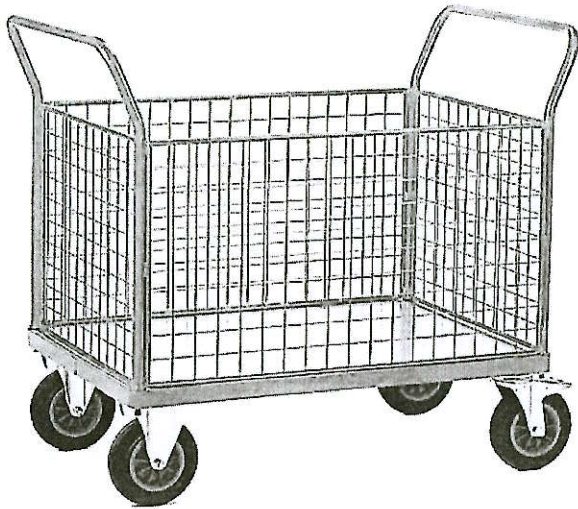
Industrial cage trolley size/dimension 1200mmx600mm color (BLACK/BLUE)