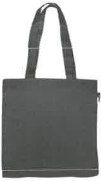
Figure 9 Conference reusable bags