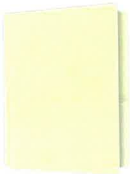
Figure 8 Folders