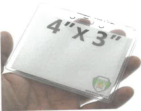
Figure 5 Accreditation badge holder