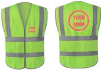
Figure 7 Protocol Reflectors