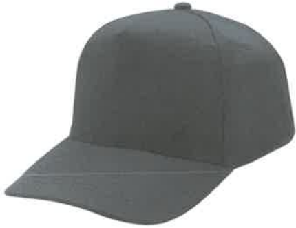
Figure 4 Adjustable Panel Cotton caps