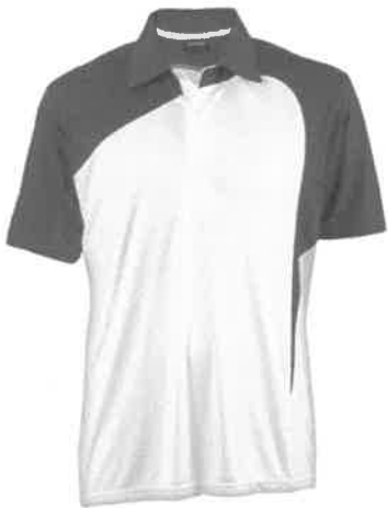
Figure 2 Golf Tshirt