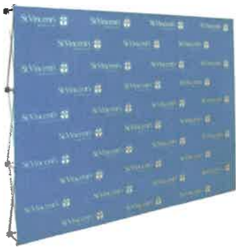
Figure 10 BackDrop banner