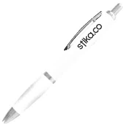
Figure 3 Conference pen with black ink